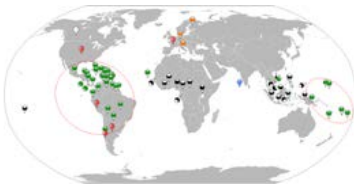
Figure 2. Geographical global vision of countries involved in ZIKV active transmission (by vector or by sexual route) or imported cases. Period 2014 - 1st May 2016. Green map pins indicate the human cases in the period 2014- 1st May 2016. The orange map pins indicate the imported cases in Italy, Germany and Finland. The black and white map pins indicate the human cases in the period 1954-2014. The red map pins indicate the sexual transmitted cases. The blue map pin indicates the only local exported case in Maldives. Red circles virtually collect the human cases in South American and Pacific Islands zones.

*LAC: local acquired cases, **IC: imported cases, †LEC: local exported case, ‡LST: local sexual transmission